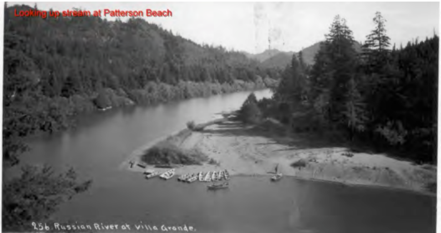
PATTERSON POINT - HISTORIC POSTCARD

PLEASE RETURN WITH CHECK TO FOVG, PO Box 28, VILLA GRANDE, CA 95486