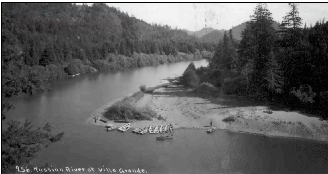
LOOKING UP STREAM AT PATTERSON POINT - HISTORIC POSTCARD

PLEASE RETURN WITH CHECK TO FOVG, PO Box 28, VILLA GRANDE, CA 95486