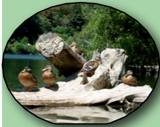
DUCKS AT PATTERSON BEACH

PLEASE SEND ITEMS THAT YOU MIGHT LIKE POSTED IN FOVG NEWS TO: KYLA BROOKE, EDITOR HOUSEMATTERS@KBROOKE.BIZ