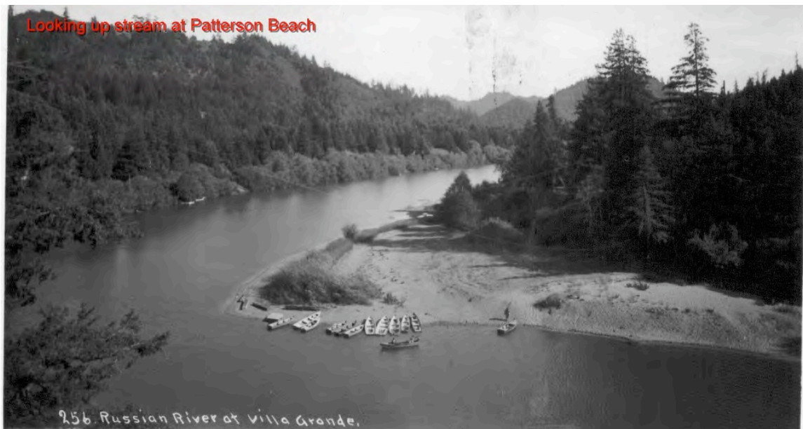
LOOKING UP STREAM AT PATTERSON POINT - HISTORIC POSTCARD DATE UNKNOWN

PLEASE RETURN WITH CHECK TO FOVG, PO Box 28, VILLA GRANDE, CA 95486