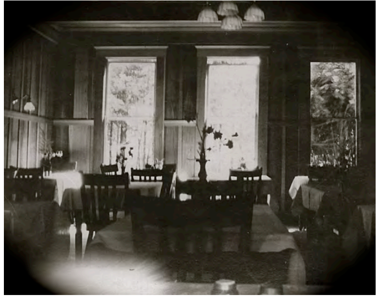
Villa Grande Hotel Dining Room in Days Gone By

The old Hotel is at 21849 East Street, Villa Grande. To purchase tickets or make a donation, go to: http://villagrande.org/winterdinner or call Roberto at (707) 865-9558.