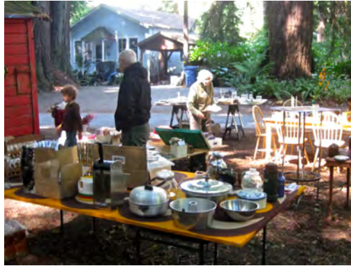
Treasure Chest Sale at Villa Grande Firehouse