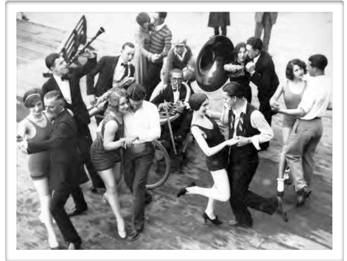
Photo Courtesy of California Historical Society Collection at USC. Los Angeles Area Chamber of Commerce, CHS-31222

Seating is limited to 50 guests, so don't delay. Dig out your spats and feather headbands and sign up now to get your secret password to enter. Tickets are $75 each for FoVG members, $85 for everybody else and the corkage fee is only five bucks for your wine with dinner. Buy your tickets online with PayPal: villagrande.org/anygoes or call the FoVG office at (707) 865-9558 and tell them Louie sent you.