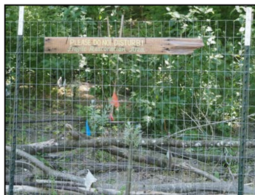
Irresponsible behavior by PPP visitors has forced us to fence off sensitive restoration areas.

We requested and Open Space subsequently approved a cap of 150 people accessing the