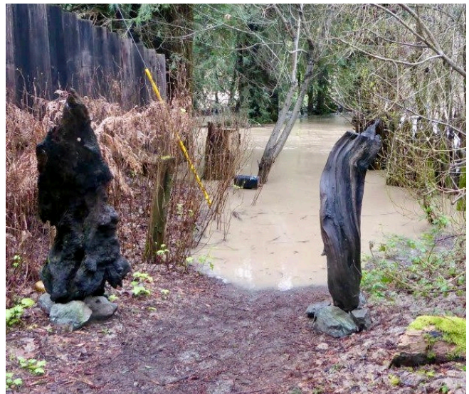
Patterson Point Preserve was 100% underwater!

PORTABLE TOILET: The flood floated the Preserve toilet and leaned it over, but the surrounding “folly” of branches and stakes we constructed prevented it from being swept away. What was originally a visual concealment project also has a practical benefit!