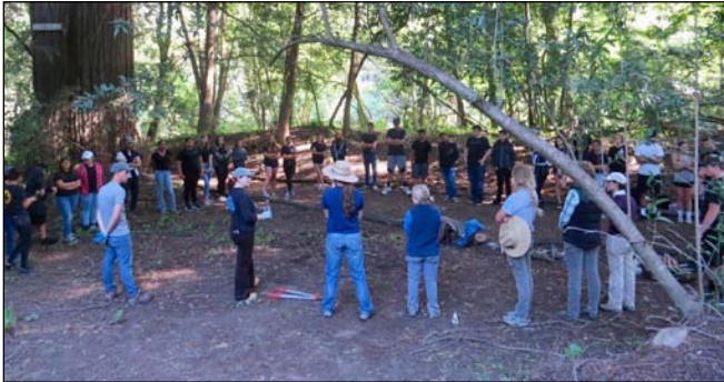
A team of FoVG volunteers also spent time clearing out dangerous limbs and brush before the students' arrival.

To kick off the project, 80 students from Windsor High School, along with their teacher, came to the Preserve over two days in April to implement the first phase. Eight STRAW interns had already been prepping the students about restoration, and surveyed conditions on the Preserve in advance of the work days.