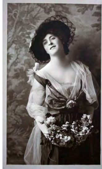
F. Scott Fitzgerald - 1916

Price is $85 each, and seating is limited to the first 45 reservations, so don't tarry. To make your reservations, go to: villagrande.org/drag